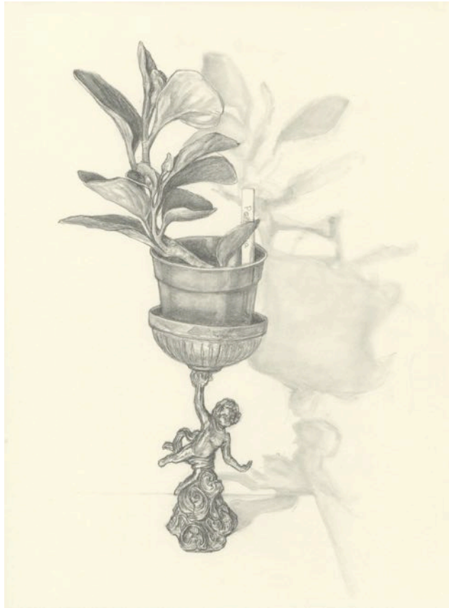
Amanda Besl Peperomia Obtusifolia , 2019 Graphite on paper 15 x 11 inches (25.25 x 19.25 framed) 550.00

EXHIBIT A / 22 EAST MARKET, CORNING NY / INFO@EXH-A.COM / 607.259.1008