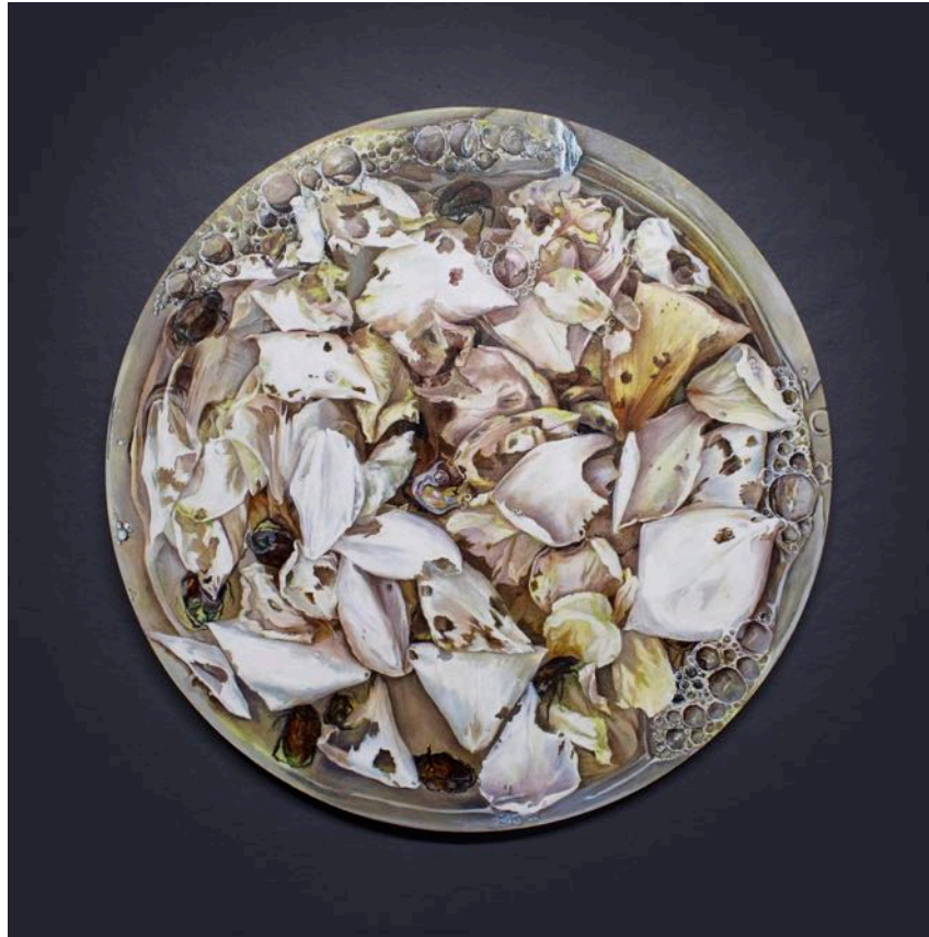
Amanda Besl Popillia Japonica 1 , 2019 Oil on board 19.5 inches dia. 2,800.00

EXHIBIT A / 22 EAST MARKET, CORNING NY / INFO@EXH-A.COM / 607.259.1008