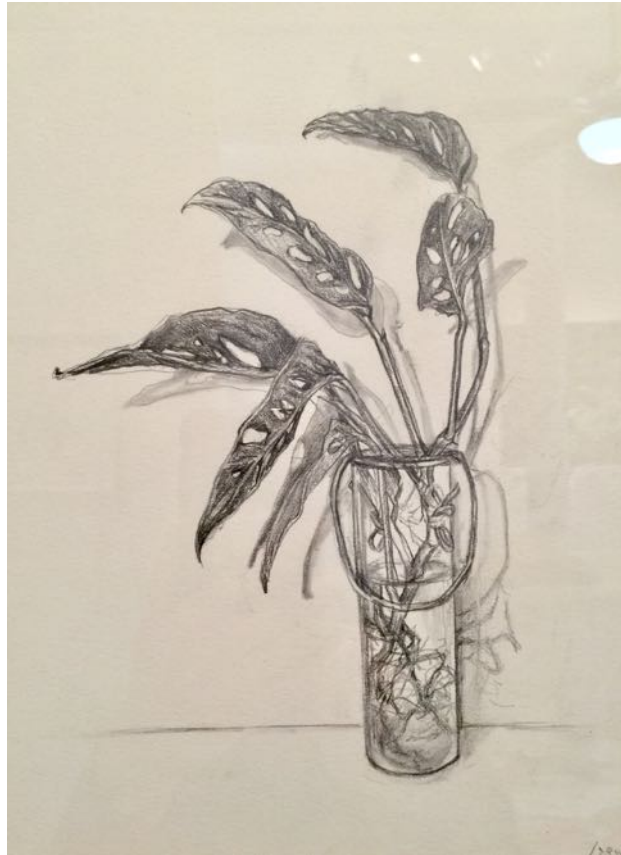
Amanda Besl untitled , 2019 Graphite on paper 12 x 9 inches (15.25 x 12.25 framed) 450.00

EXHIBIT A / 22 EAST MARKET, CORNING NY / INFO@EXH-A.COM / 607.259.1008