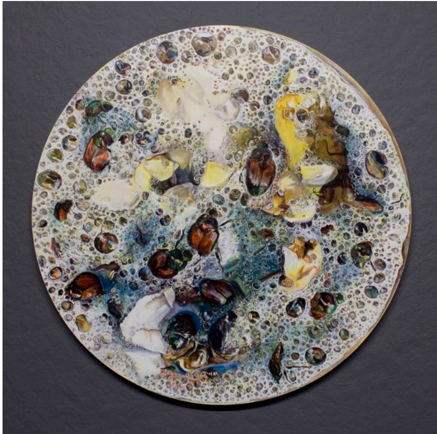
Amanda Besl Popillia Japonica 3 , 2019 Oil on board 19.5 inches dia. 2,800.00

EXHIBIT A / 22 EAST MARKET, CORNING NY / INFO@EXH-A.COM / 607.259.1008