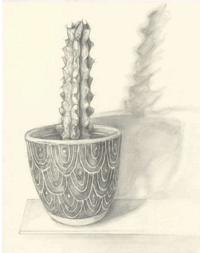
Amanda Besl Myrtillocactus Geometrizzans , 2019 Graphite on paper 12 x 9 inches (15.25 x 12.25 framed) 450.00

EXHIBIT A / 22 EAST MARKET, CORNING NY / INFO@EXH-A.COM / 607.259.1008