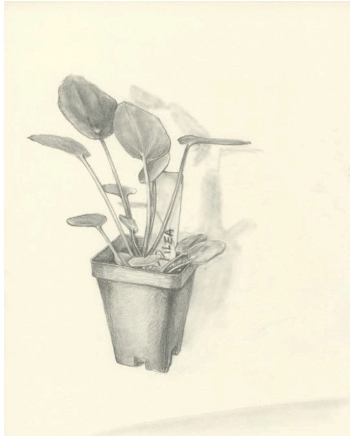
Amanda Besl Pilea Peperomoides , 2019 Graphite on paper 12 x 9 inches (15.25 x 12.25 framed) 450.00

EXHIBIT A / 22 EAST MARKET, CORNING NY / INFO@EXH-A.COM / 607.259.1008