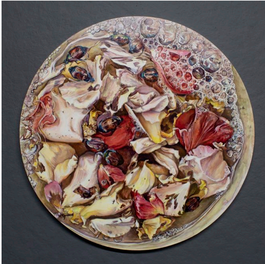
Amanda Besl Popillia Japonica 2, 2019 Oil on board 19.5 inches dia. SOLD .00

EXHIBIT A / 22 EAST MARKET, CORNING NY / INFO@EXH-A.COM / 607.259.1008