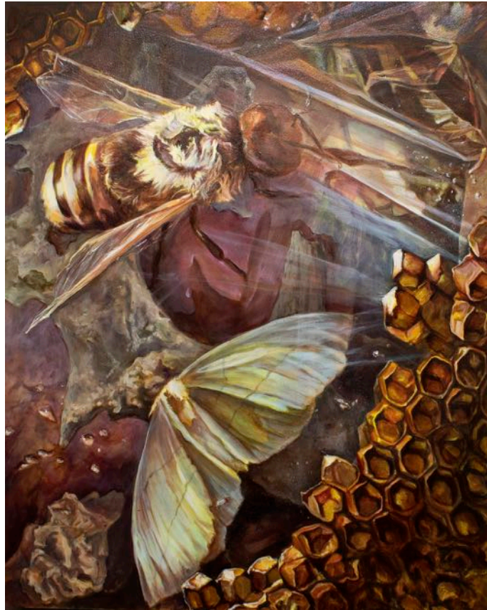
Amanda Besl Orpheus , 2019 Oil on board 30 x 24 ON HOLD .00

EXHIBIT A / 22 EAST MARKET, CORNING NY / INFO@EXH-A.COM / 607.259.1008